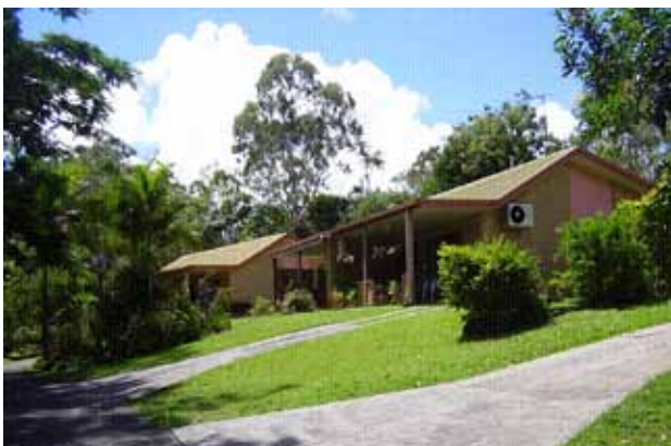
■ Carinya Home for the Aged, Atherton: Independent living units.

Most respondents (60%) preferred a stand-alone detached villa, but many (50%) did not mind a semi-detached unit.