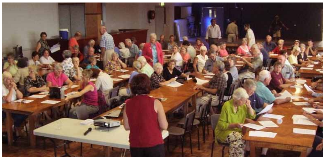
■ Community members at the Atherton forum.

The Action Group will now use the results of the survey to show that there is a substantial demand for retirement village living with appropriate aged care facilities on the Tablelands and that this represents an opportunity to be fulfilled.