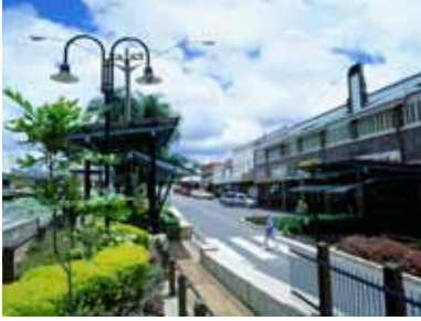
■ Atherton emerged as the first preference for the location of a retirement complex or aged care facility.

The most popular first preference of location for a retirement complex or aged care facility was Atherton (59), followed by Mareeba (47) and then Malanda (10).